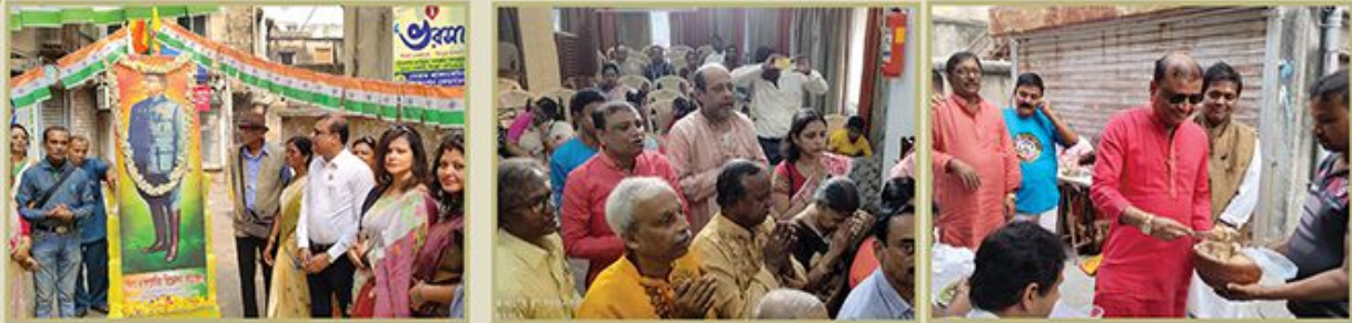
Jan 23: 126th birth anniversary of Netaji Subhas Chandra Bose was celebrated at Serum Auditorium Jan 26: Celebration of Saraswati Puja and Republic Day at SERUM Auditorium Annual General Meeting, 2022 - 23