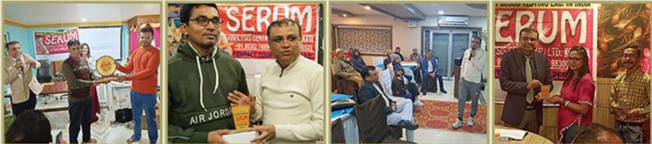
Jan 1: North 24Pgs held at Jibanpur Vanaprastha Village Jan 7: Malda HQ was held at Hotel Continental, Malda Jan 8: North Bihar was held at Hotel Galaxy 16 Jan 14: North East was held at Welcome Palace, Agartala