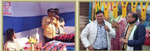
Jan 29: Inauguration of SERUM Collection Centre at Prasadpur, Bamun Para of HWJNG zone & Munsirhat of HWBPK zone