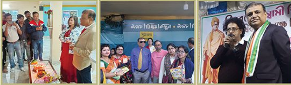
Jan 1: 24th Foundation Day of SERUM Analysis was celebrated at Jibanpur Jan 11: Suchetana Stall inauguration at Literature & Little Magazine Fair Jan 12: 160th birthday celebration of Swami Vivekananda